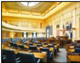
House of Delegates Chamber