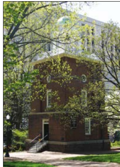
Bell Tower on Capitol Square

The Neoclassical Oliver W. Hill, Sr., building, begun in 1893 as the Commonwealth's first state library building, stands to the east of the Capitol and south of the Executive Mansion. The Lieutenant Governor and the Department of Agriculture and Consumer Services have offices here. In the southeast corner of Capitol Square is the twelve-story Washington Building, an imposing structure completed in 1924 and currently undergoing renovations.