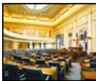
House of Delegates Chamber

The Virginia Capitol restoration project has succeeded in its project vision of continuing the vitality of our nation's second oldest working Capitol by sustaining the integrity, viability, and dignity of the Capitol as a symbol of a prosperous and democratic Commonwealth.