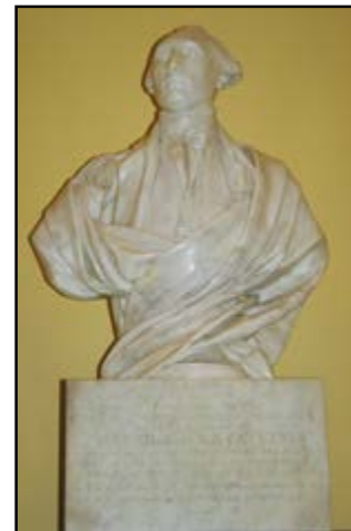
Houdon bust of the Marquis de Lafayette

In 1930, the Virginia General Assembly authorized the placing of seven marble busts in the Rotunda as a Virginia "Hall of Presidents." All seven busts were installed on various dates in 1931, using private funds. Virginia is known as the "Mother of Presidents" with eight of her sons (including Washington) serving in that office. The busts depict Thomas Jefferson, James Madison, James Monroe, William Henry Harrison, John Tyler, Zachary Taylor, and Woodrow Wilson.