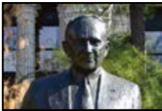
Harry Flood Byrd, Sr.

Among those honored with trees on the grounds are Presidents Washington and Tyler, Governors Colgate Darden, Charles Robb, and Gerald Baliles, and Nobel Peace Prize Laureate Martin Luther King, Jr. The newest monument on Capitol Square honors Virginians who were active in the Civil Rights Movement during the 1950s and 1960s and was dedicated on July 21, 2008.