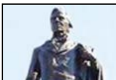
Governor William Smith