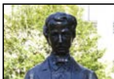
Edgar Allan Poe

A seated bronze figure 6 ft. high, he was President of the American Medical and American Surgical Associations and founded the University College of Medicine (VCU/MCV) in 1913.