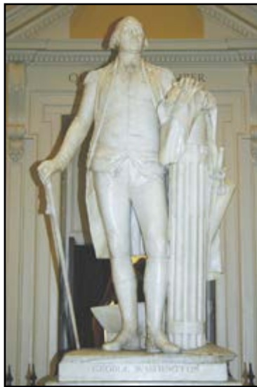
Houdon statue of George Washington

Houdon’s statue alludes to the similarities between Washington and the ancient Roman General Cincinnatus who, when Rome no longer needed him, gave up his military power and returned to the simple life of a farmer. The artist carefully balanced the military and civilian elements of Washington’s career: his sword is by his side and he rests his left hand on a fasces (a bundle of rods, which was a Roman symbol of power), but he carries a civilian walking cane and stands next to a plow. Washington wears his Revolutionary uniform, but his head is uncovered and his facial expression is fatherly. Houdon’s monument to America’s foremost hero recalls Washington’s life as a soldier, statesman, and virtuous private citizen.