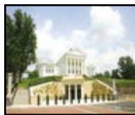
Virginia State Capitol