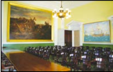
The Old Senate Chamber

The Old Senate Chamber originally served for more than 50 years as the General Court Room for the Commonwealth of Virginia. After serving as a courtroom for half a century, the Chamber was converted in the early 1840s for use by the Senate of Virginia, which previously met in a smaller room on the third floor. In late 1861, the room was remodeled as the “Hall of Congress” for the Confederate House of Representatives, which met here from 1862 until 1865. Former U.S. President John Tyler and Confederate General Thomas “Stonewall” Jackson each lay in state here after their deaths. After the Civil War, the room was reclaimed by the Virginia Senate, which held its last Session in this room in 1904.