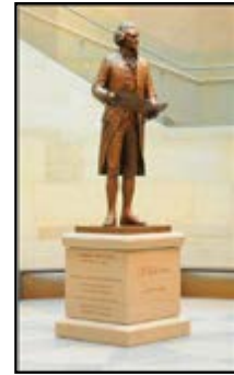
Thomas Jefferson, Architect of Liberty

The Virginia General Assembly appropriated $104.5 million to restore and preserve the Virginia Capitol and to bring it up to 21st-century standards for a working seat of government. Problems of moisture penetration, outdated electrical and plumbing systems (some of them 100 years old), and insufficient space were addressed in a comprehensive plan laid out by Dr. George Skarmeas of the Hillier Architecture firm of Philadelphia. In addition, a 27,000-square-foot underground extension beneath the Capitol's South Lawn was designed to provide additional meeting and exhibition spaces, a visitor center, gift shop, and café. On May 4, 2012, a newly commissioned bronze sculpture was dedicated entitled Thomas Jefferson, Architect of Liberty . It is an original larger-than-life statue representing Mr. Jefferson at approximately age 42 when he was architect of the Virginia Capitol.