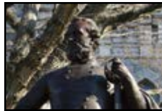
Thomas J. “Stonewall” Jackson

A bronze standing figure 10 ft. high, Senator Byrd is depicted carrying the budget in his left hand. Known for his “pay as you go” policies, he was a U.S. Senator and Virginia Governor.