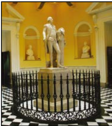
Houdon statue of George Washington

In 1784, the Virginia General Assembly commissioned a marble statue of George Washington and a marble bust of the Marquis de Lafayette, with the intent that the statuary would be placed in the new Capitol as symbols of public virtue from the Old and the New Worlds. These two statues were done from life by renowned French sculptor Jean-Antoine Houdon. Lafayette was voted a citizen of Virginia by an "act of assembly" in 1785 for his valuable services on behalf of the Commonwealth during the American Revolution. Lafayette's bust was received from France in 1789 and Washington's statue was put into place in 1796.