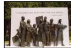
Civil Rights Memorial

A bronze standing figure 7.5 ft. high, its 9 ft. high pedestal is inscribed on all 4 sides highlighting Smith’s career, including being a Virginia State Senator and Virginia Governor.