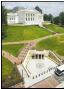
Virginia State Capitol after restoration