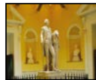
Houdon statue of George Washington