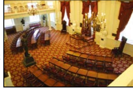
The Old Hall of the House of Delegates

The Old Hall of the House of Delegates is located off the Rotunda in the north end of the Capitol. At 76 feet in width, it has a dramatic coved ceiling, projecting cornices, and carved interior woodwork, which reflect the Capitol's Roman Classicism. Delegates assembled in rows of seats arranged around the Speaker's chair. As there was no other large meeting hall in the area, the room was also used for community events and church services in its early years. The Virginia House of Delegates met in the Old Hall from 1788 until 1904.