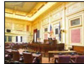
Senate Chamber

The Senate ( right ), is composed of 40 Senators who are elected every four years. The Lieutenant Governor, a statewide elected official, is the President and presiding officer of the Senate. The President Pro Tempore and the Clerk of the Senate are elected by the membership, each for a four-year term. Portraits of former Lieutenant Governors who did not become Governor of Virginia are hung on the Chamber walls. Desks for the Senators fill the room, surrounding the Speaker's and Clerk's podiums. Over the podiums is the marble "Signers Tablet" commemorating the seven Virginians who signed the Declaration of Independence.