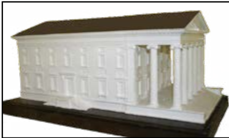
1786 plaster model of the Capitol by Fouquet

Jefferson was responsible for recommending the Shockoe hilltop location, choosing the Classical temple form, and arranging the interior floor plans to accommodate the legislative, executive, and judicial branches of Virginia’s new “Commonwealth” government.