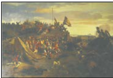
Painting by Eugène-Louis Lami

The Storming of a British Redoubt by American Troops at Yorktown , painted by the French artist Eugène-Louis Lami in 1840 ( left ), shows an American attack on a British redoubt at Yorktown in October 1781. That same month British General Cornwallis surrendered to General Washington and America won its national independence on the fields of Virginia. The painting was a gift to the Commonwealth of Virginia in 1878 from Virginia-born philanthropist William Corcoran.